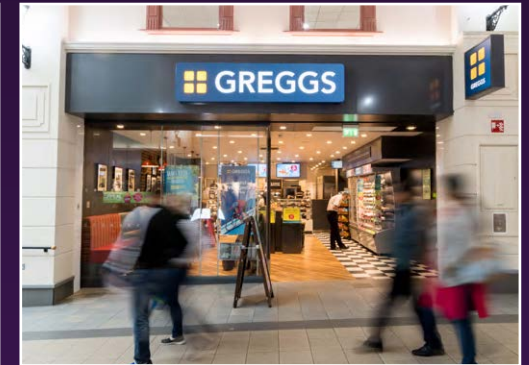
Greggs - 2,700 sq ft