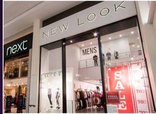
Next 23,500 sq ft