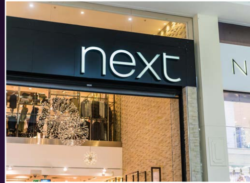
New Look 20,750 sq ft