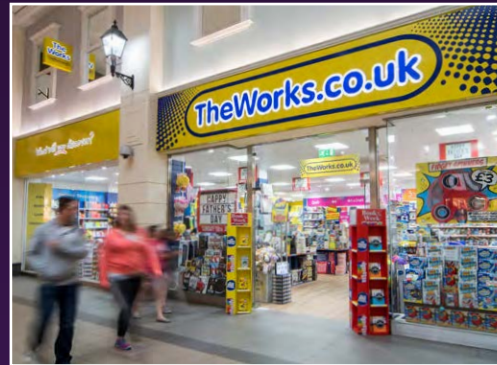
The Works - 3,700 sq ft