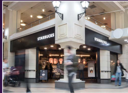
Starbucks - 2,025 sq ft