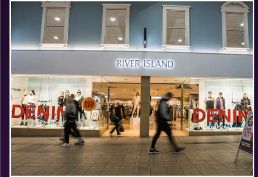
River Island 7,604 sq ft