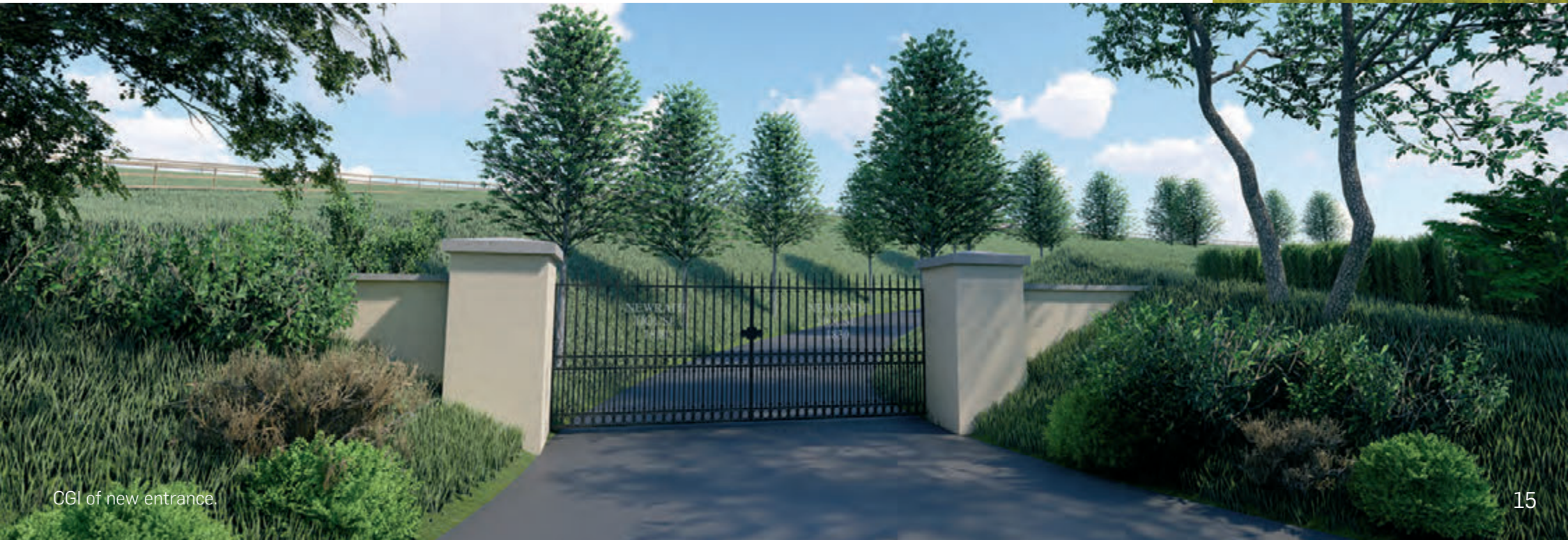
CGI of new entrance.