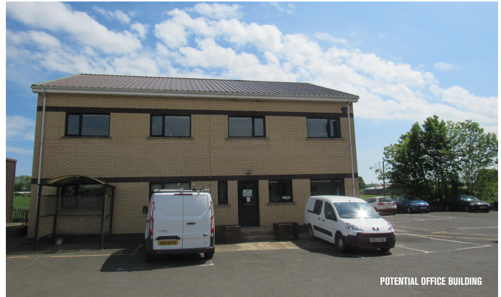
POTENTIAL OFFICE BUILDING