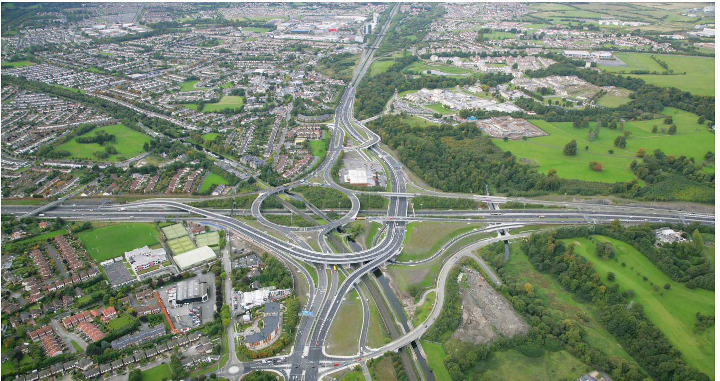
The M50 motorway provides ease of access to all arterial routes throughout the country.