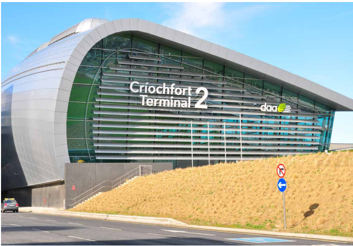
Dublin Airport is located to the east of the subject lands.

Uses include Heavy Vehicle Park, Open Space, Plant Storage, Sustainable Energy Installation, Waste Disposal and Recovery Facility, Utility Installations, Retail-Local <150sqm, Abattoir, Fuel Depot/Fuel Storage, Restaurant/Café and Telecommunication Structures.