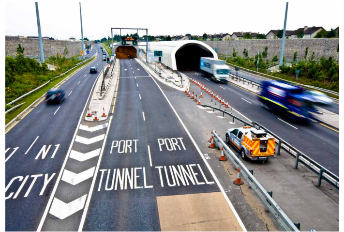
Dublin Port Tunnel enables ease of access to Dublin City Centre.