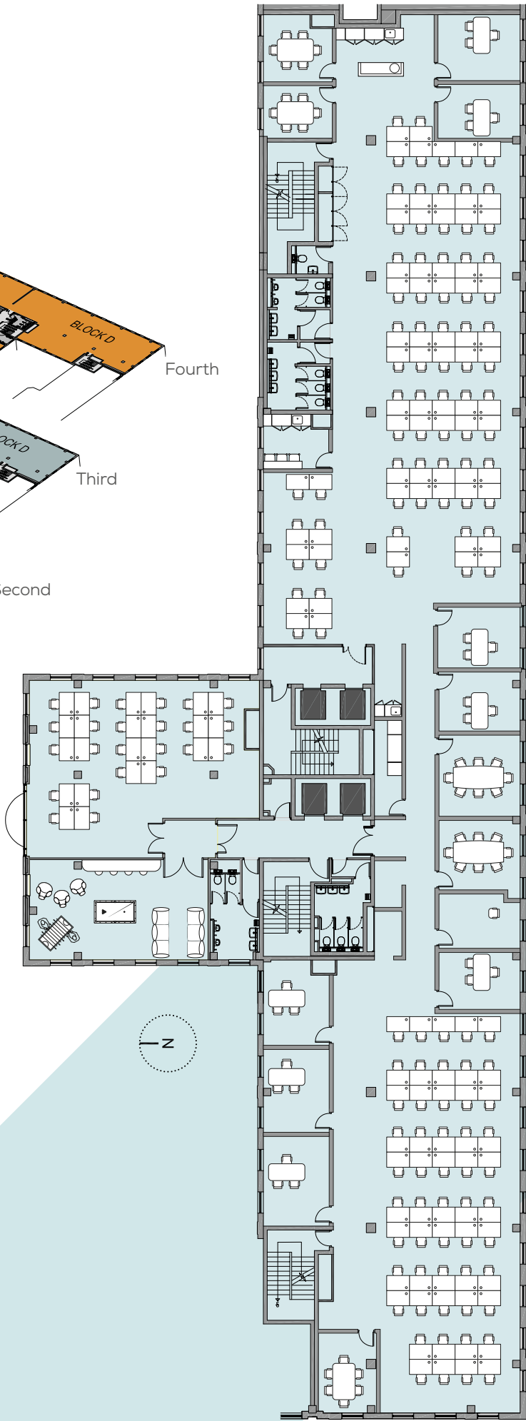
Sample Layout For Indicative Purposes Only