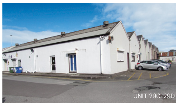
UNIT 29C, 29D